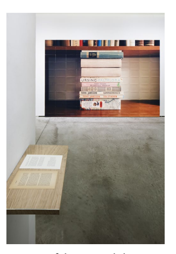
(above) installation view of the text and the image (below) installation view of the image part with an audience walking by

A work with a short essay and an image, reflecting the distances created by age, nationality and values, where I projected life paths on the layers of books. There collection of small things create a bigger entity, and it is made to "age" as we all do.