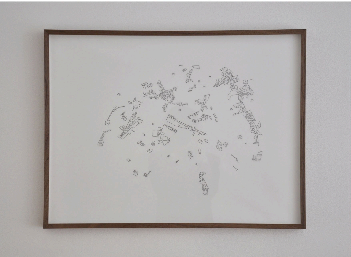
A bird's view of the world. In Paris.